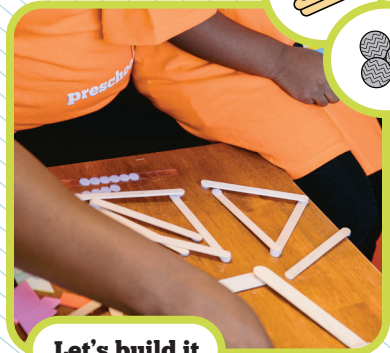
Let's build it