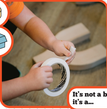
It's not a box, it's a...